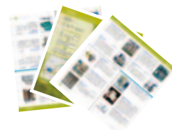
参观指南 Visitor guide