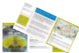
观众门票 Visitor tickets