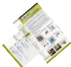
电子期刊 E-news letter