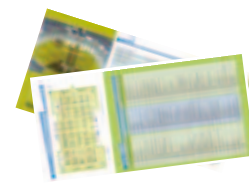
现场地图 Onsite map