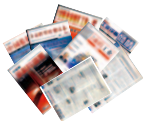
杂志广告 Magazine advertisement